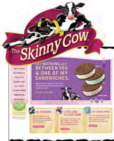
Left: Skinny Cow has tapped into its brand values of low-fat and great taste to expand its range into new areas.